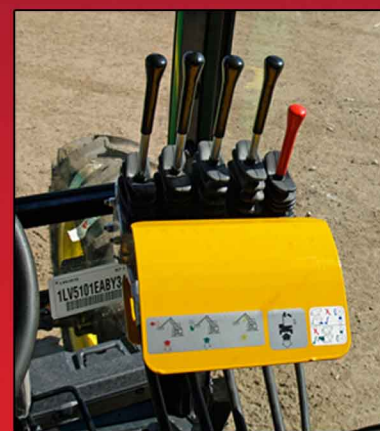
Five Lever Cable Controls